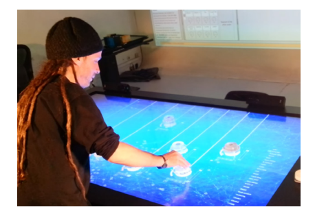
Figure 3 - Performer using TD's tangible controller system with Ableton Live