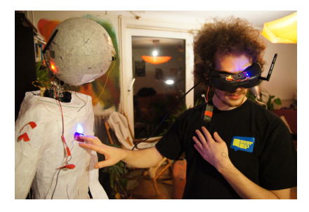
Figure 1 - Telerobotic System for exploring Mediated Touch [9].