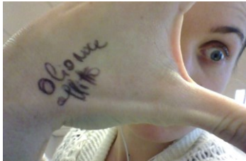
Figure 4 – Reminders marked on the hand. They were described as follows: “ olio noci ’, walnuts oil expensive must move from senny shelf and store in dark, refrigerator otherwise it gets rancid. affitto: tonight must pay rent. very trivial yet essential”. The theme of creating reminders for things that were both easy to forget but especially important was also recurring in our questionnaire results.

would be called if needed”. Markings for identification purposes were also mentioned by participants who compete in sports competitions. A further pragmatic use of body markings was cheating at exams.