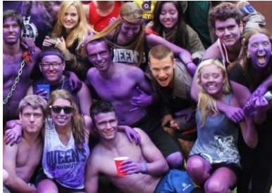
Figure 1 - Engineering students in Canada dying their body purple for their first week at university. This reinforces their identity as engineering students and makes them easily recognizable for each other and others.