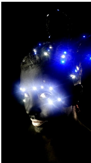
Figure 3 - Katia Vega's 'beauty technologies' explore extending the interactive potential of the body. A common theme in her work is that, like with our bodies, not all of the interactions can be consciously controlled [10,38].

b) skin provides a larger interaction surface than mobile devices [42]; c) the skin provides tactile feedback to users through their own body [29] as well as d) appeals to muscle memory, hand-eye coordination and knowing ones' body 'like the back of one's hand' [13,16,17,21]. We intend our work to provide a clearer rationale of when to use (and not use) on-body interactions.