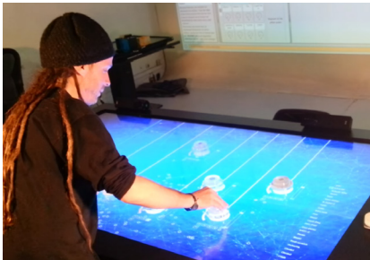
Figure 3 - Performer using TD's tangible controller system with Ableton Live

Paul revisited haptic feedback again through his work with flexible displays. With colleagues from the Human Media Lab at Queen's University Paul presented a flexible smartphone, Reflex [11]. Reflex measures the strain placed on its display and uses this information to generate haptic feedback. Difference in sensing fidelity of prototype iterations further underlined the importance of precise measures and high temporal synchronization between measures and actuation.