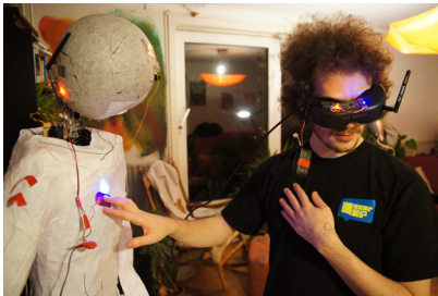
Figure 1 - Telerobotic System for exploring Mediated Touch [9].

possible for users to assess the weight and compliance of a virtual object [8].